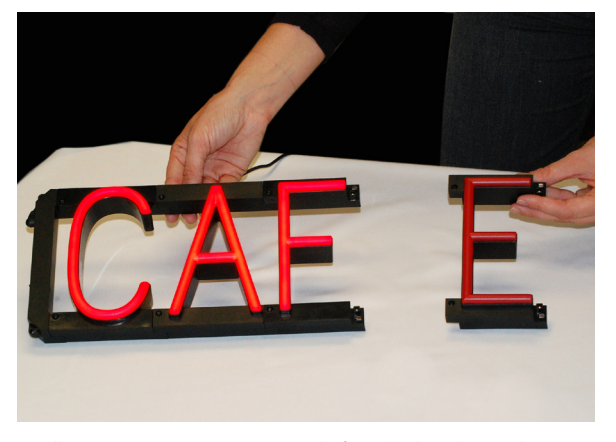
SpellBrite LED Signage is comprised of interlocking letters that allow users to easily assemble a powerful, customized illuminated sign in minutes.

"Bright illuminated signs attract more customers, because they capture the attention of your prospects – the human eye is drawn to light 5 to 6 times the ambient level," said Sean Callahan, CEO of Optiva. "Printed signs lack impact in the day and fade away at night. The traditional light source for bright signs, neon, is fraught with numerous issues. That's why we invented SpellBrite."