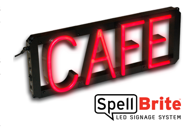
With SpellBrite, you get the same bright pop of neon signs, but none of the hassles.

Retailers can attract more customers by creating unique, targeted signs featuring products and services offered, phone numbers, lunch combos, seasonal promotions, websites, extended business hours or any other custom messages. No other signage medium offers the flexibility and customer drawing impact of SpellBrite.