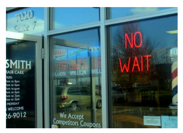
When there is no wait, this barber turns on his SpellBrite sign to attract customers.